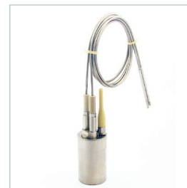
NanoVACQ 2Td FullRadio with semi-rigid probes