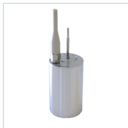
NanoVACQ 1Tc FullRadio, standard antenna