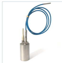
NanoVACQ 1Td FullRadio with Teflon® PFA probe