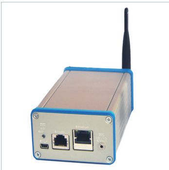
TMI-Orion Radio Transceiver

Data transmission and visualization are done in real time or at the end of the industrial process.