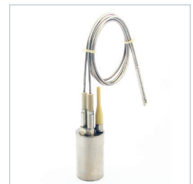
NanoVACQ 2Td FullRadio with semi-rigid probes