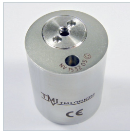
NanoVACQ PT Ex