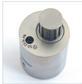
NanoVACQ HT Ex